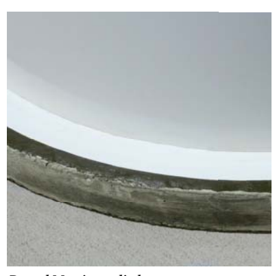
Densyl Mastic applied to protect tank bases from corrosion.