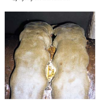
Densyl Mastic Blankets applied to flange pair.