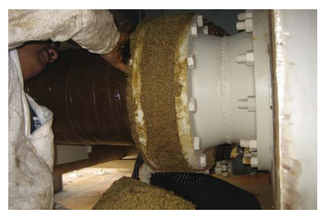
Denso Profiling Mastic will adhere to metal, PVC, polyethylene and concrete.