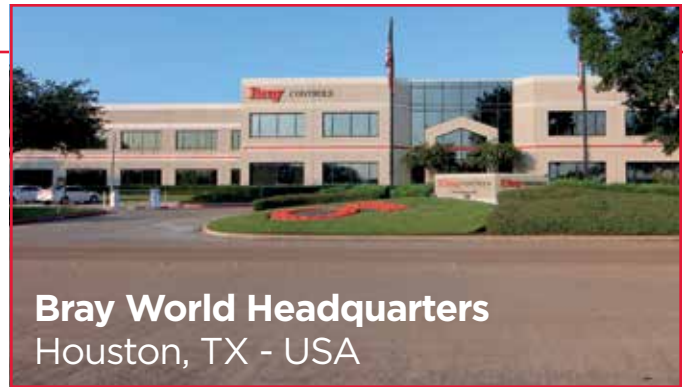
Bray World Headquarters Houston, TX - USA

United Kingdom Inchinnan +44.141.812.5199